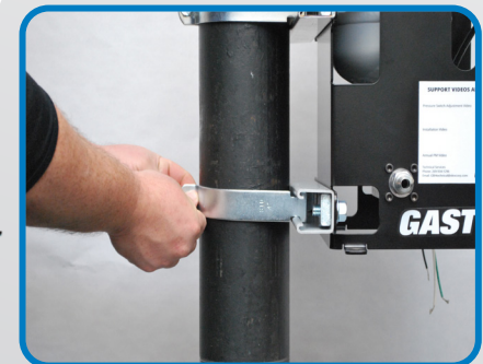
Secure lower pipe clamp